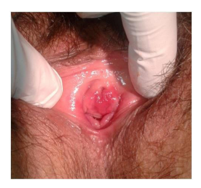
Figure 1. Erythematous Patch in the Vaginal Mucous Membrane and Vestibule

We dismissed the infectious and neoplastic causes, as well as other common disorders such as lichen planus or pemphigus vulgaris and we thought that it could be DIV. We prescribed 2% clindamycin cream, 4 to 5 grams intravaginally, once daily for 4 weeks following with hydrocortisone ovules, 0.01 grams per ovule, once daily for 2 weeks. The patient showed a considerable clinical improvement in the follow-up examination after 4 months.