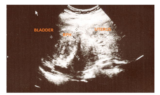
Figure 1. Transvaginal Ultrasonography of Bladder Flap Hematoma at Postoperative First Hour. BPH: bladder flap hematoma.

Tinelli et al (4) reported two cases of bladder flap hematoma in 2007. These cases were submitted to laparoscopic treatment. Tinelli et al (3) in 2009 reported 10 symptomatic women undergoing laparoscopy. The essential steps of the operation were expressed as incision of the tumescence, bladder wall dissection from the vesico-uterine space, drainage of the collection, washing of the hemato-